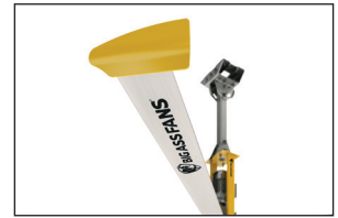
The unique aerodynamic design eliminates vortex formation at the airfoil tips.